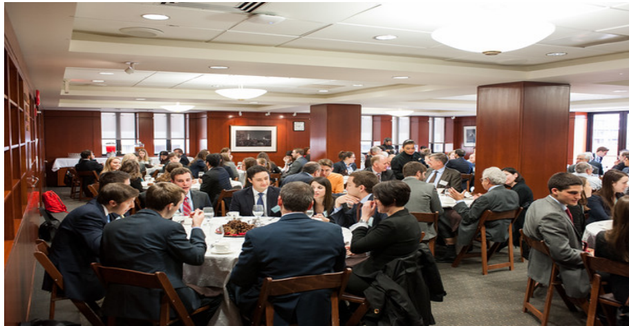
Law Review members enjoy a banquet lunch with judges, practitioners, and professors at our 2014 Symposium.

Keeping with tradition, many of our members will have their notes published in Volume 83 of the Law Review . These individuals are: